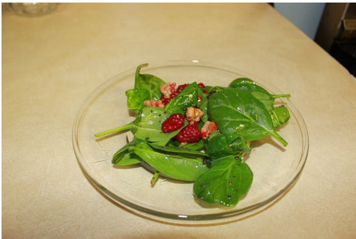
Spinach salad with raspberries & candied walnuts