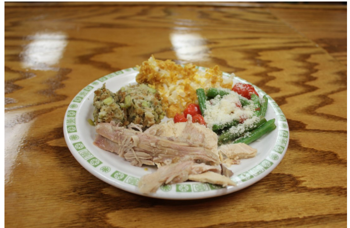
The main course: roast turkey with all the trimmings