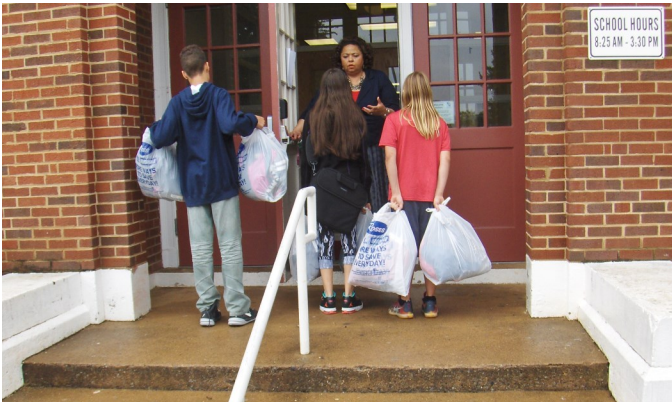
Delivering sweatshirts for homeless kids

Last week we purchased, coats, sweat shirts, hoodies, gloves, hats, and umbrellas for 35 homeless school children, as requested by the student counselors at JBMiddle school, That is 6% of Roanoke's homeless children. The cost to Council 562 was a total of $462, from funds collected from prior food collections.