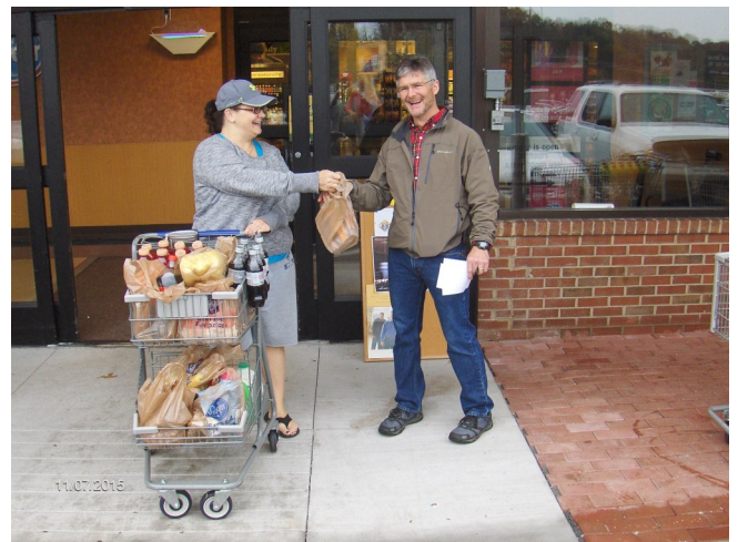
Hunger is not a Game — Knights collecting food donations at Towers Kroger