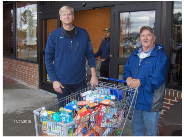
Hunger is not a Game — Knights collecting food donations at Towers Kroger