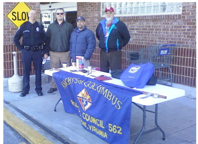
Brother Knights with Roanoke County Police Officer