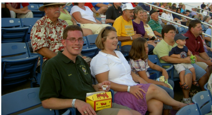
Photos from the George Slaugh Memorial Game July 29, 2010